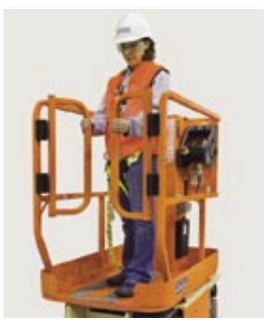
Saloon-style swing gate for ease of entry and exit.

Flashing amber beacon 1,000W – AC Inverter/charger