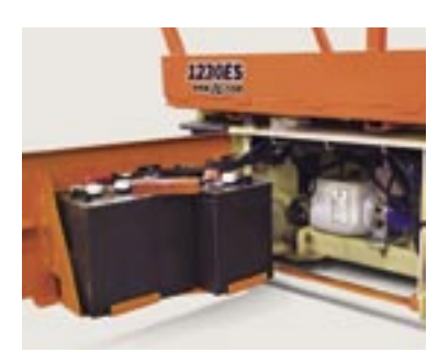
All-steel swing-out battery doors with heavy-duty hinges.